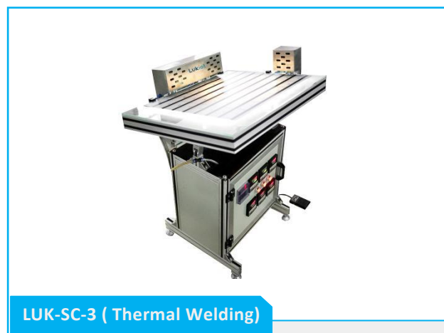
LUK-SC-3 ( Thermal Welding)

SC-3/SC-3U is designed for collating and welding of plastic foils into sheets ready for lamination.