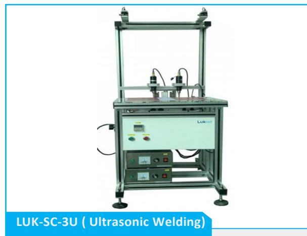
LUK-SC-3U ( Ultrasonic Welding)